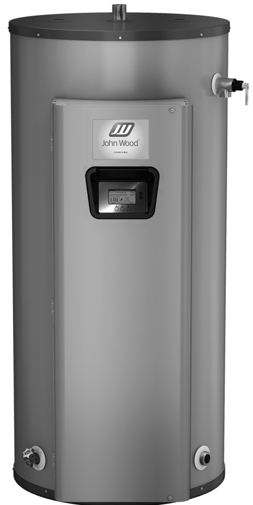
JW-EI Model Shown Above